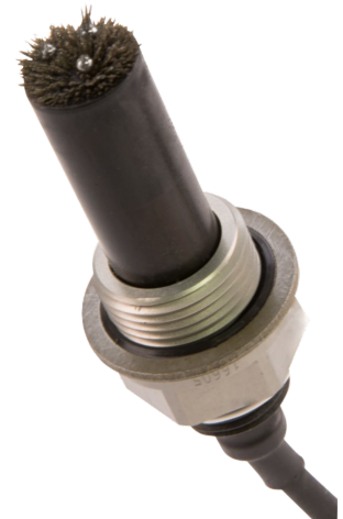
Sensor with debris attached