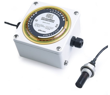
Sensor with display electronics

Supplied with a local display unit, the sensor can be installed into a wide variety of fittings and is available with either a 0-10V, 4-20mA or CAN digital output.