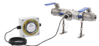
Optional In-flow adaptor